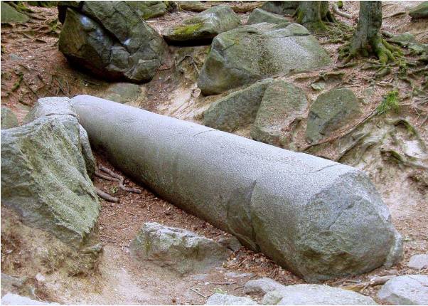
The Riesensäule, or Giant Column, was made by Roman masons in the 4th century. It is 30.8 feet long and weighs 27.5 tons.

considerable importance. During the Roman times, an extensive and almost constant 200 years of the “stone industry” developed. More than 300 processed stone blocks can still be found in the Felsberg forest. These were rejected pieces, with defects or damage, which occurred during their working. Today they are numbered and several work pieces are still intact.